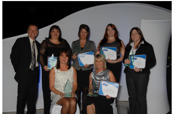
2011 Best in Business Winners

The Best in Business awards is an awards program created to honour the best practices of small to large businesses in our local area. If you know of a business who deserves to be recognized please nominate them. Criteria and nomination forms can be obtained online at www.mtpearlparadisechamber.com